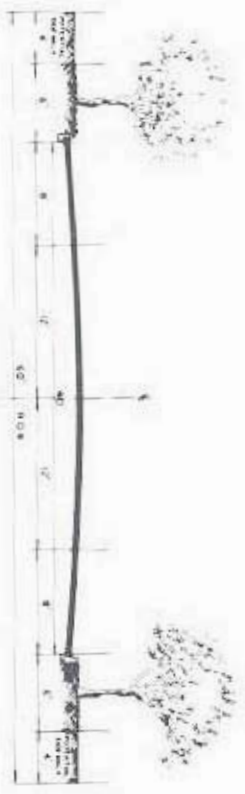
LOCAL STREET "A"