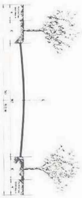
LOCAL STREET "B"