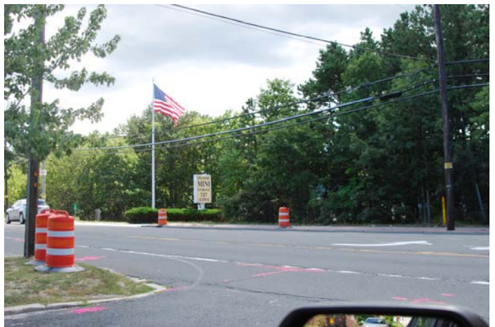
Location 13: View looking southeast from SR 24, mini-storage in background