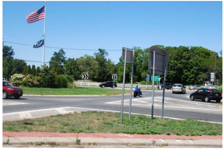
Location 4: View looking northwest towards traffic circle median (View 2)