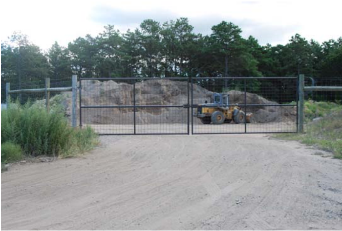
Location 12: View looking east towards industrial subdivision