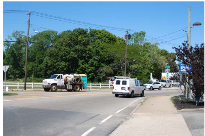
Location 3: View looking north up Peconic Avenue