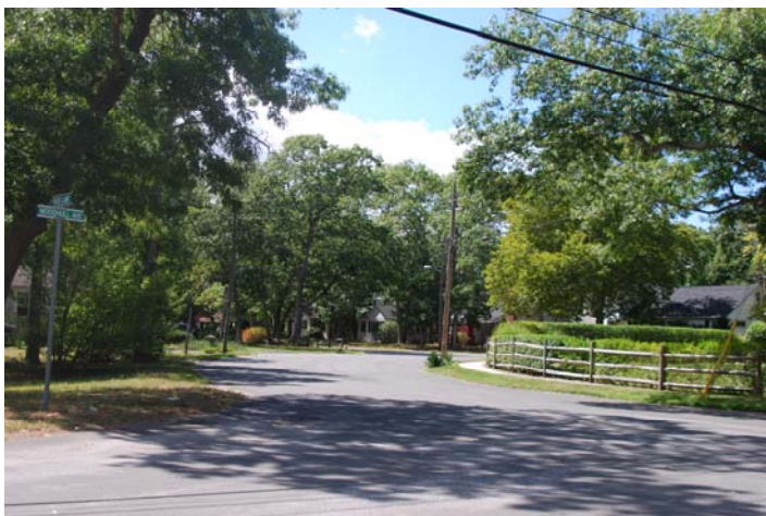
Location 24: View looking south towards single family residential development along Woodhull Avenue