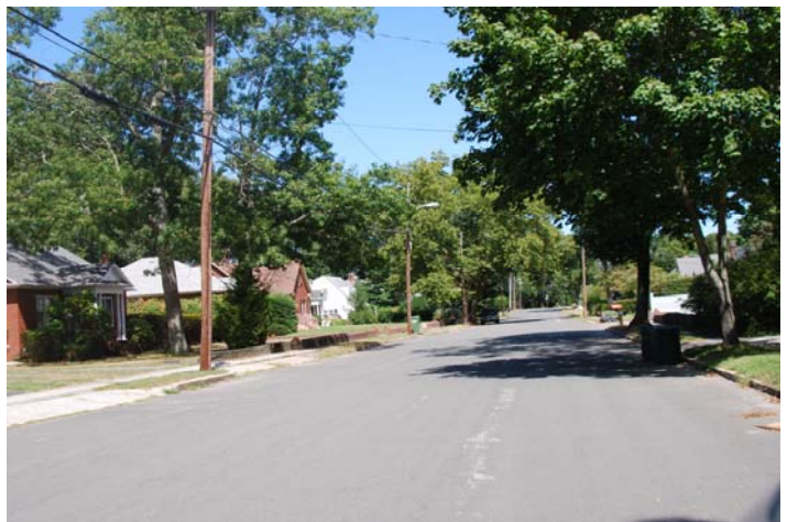
Location 24: View looking north towards single family residential subdivision along Woodhull Avenue