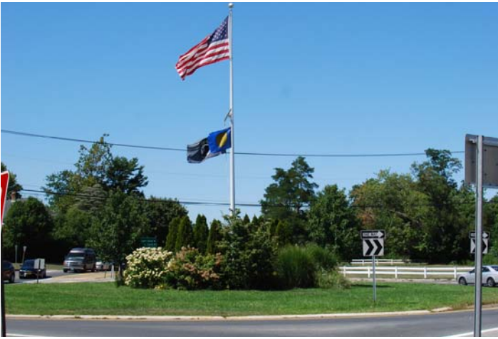
Location 4: View looking northwest towards traffic circle median