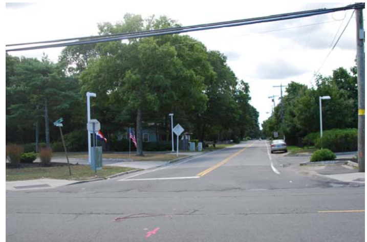
Location 15: View looking south down Ludlam Avenue