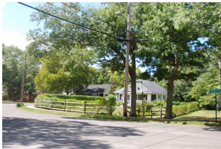
Location 24: View looking west towards single family residential development along Woodhull Avenue