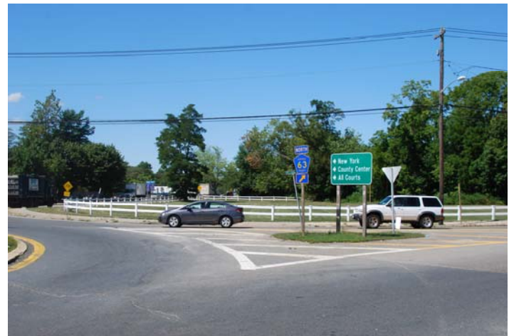
Location 3: Facing west from traffic circle, town green space in background