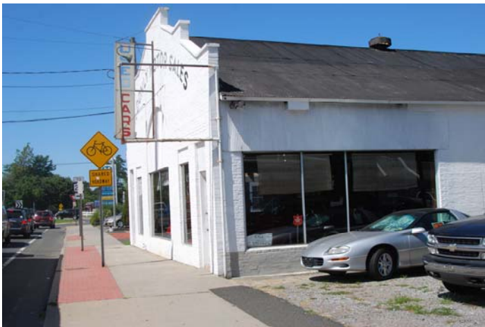
Location 2: View looking west towards car and furniture business near traffic circle