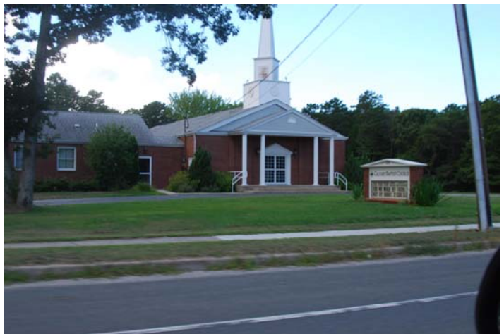
Location 18: View looking west towards Church on Riverleigh