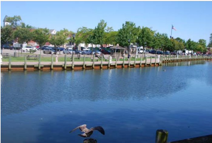
Location 6: View looking north across Peconic River, Riverhead Downtown in background