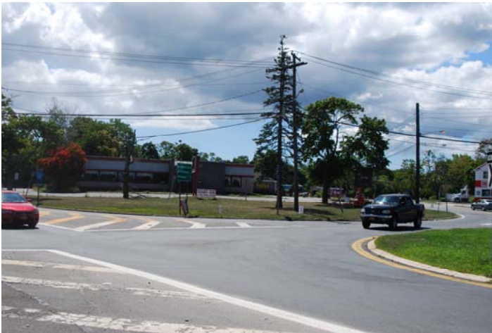
Location 4: View looking southwest towards closed diner