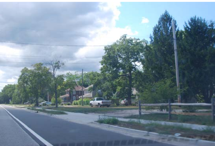
Location 23: View looking west towards residences from Lake Avenue