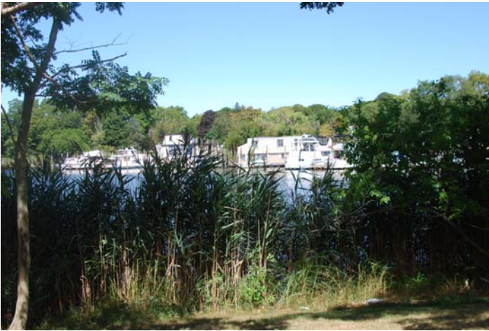
Location 14: View looking north towards Peconic River