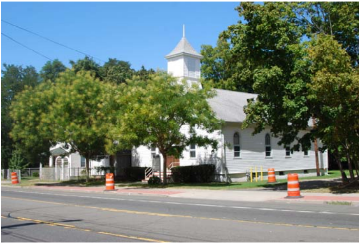
Location 8: View looking north towards church building