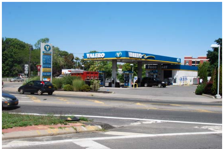
Location 4: View looking north towards gas station from traffic circle