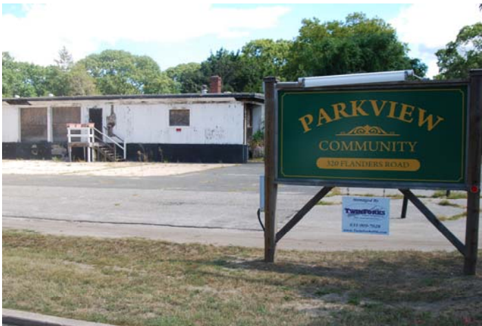
Location 13: View of east manufactured housing community with abandoned property in background