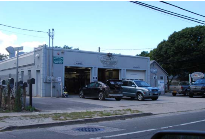
Location 19: View looking west towards auto repair shop off of Riverleigh Avenue