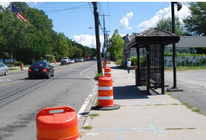
Location 4: View looking east towards bus stop and shelter