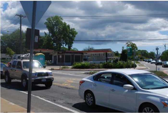
Location 3: View looking south towards abandoned gas station from near traffic circle