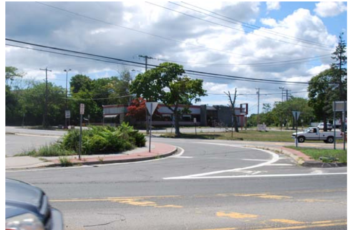
Location 4: View looking southwest towards closed diner