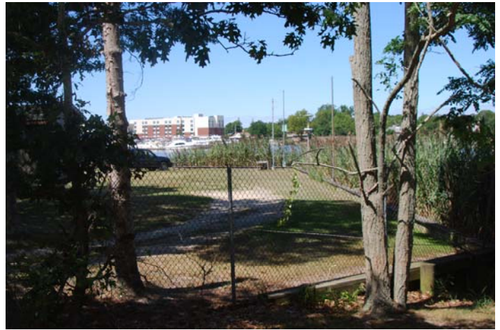
Location 14: View looking northwest towards Peconic River