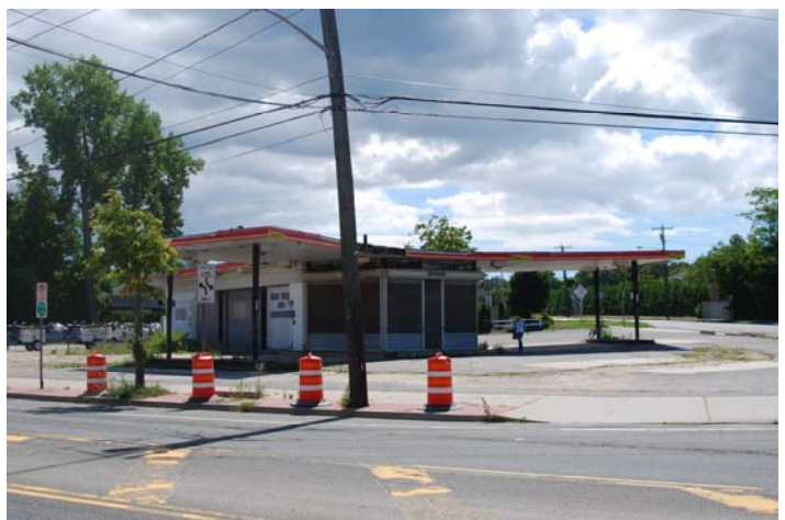
Location 3: View looking southeast towards abandoned gas station