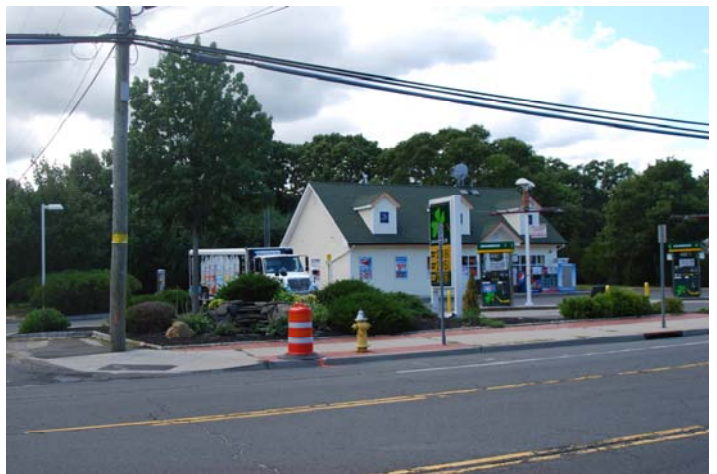
Location 15: View looking southwest towards a new convenience store and filling station