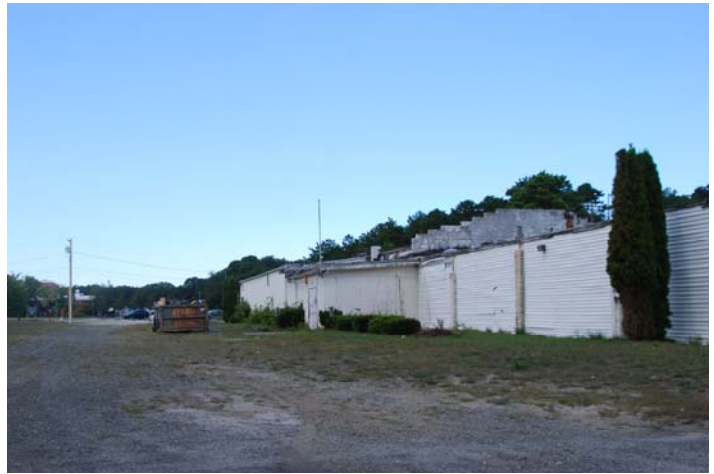
Location 16: View of vacant building, east of Phillips Elementary School