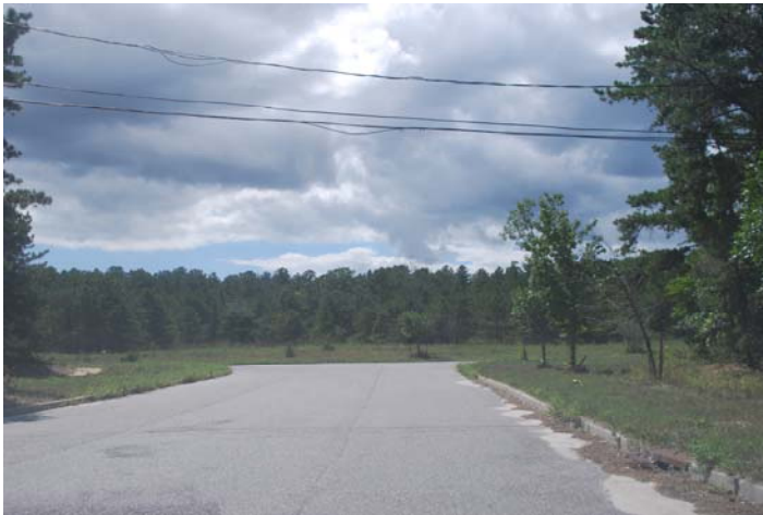
Location 10: View looking west down Enterprise Drive towards industrial subdivision