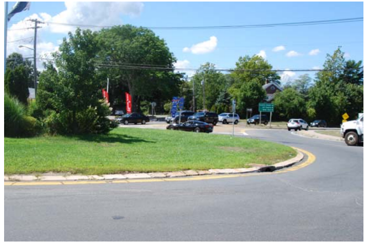
Location 3: View looking southwest towards median of traffic circle (View 1)