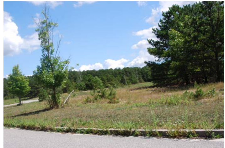
Location 11: View looking northeast towards industrial subdivision