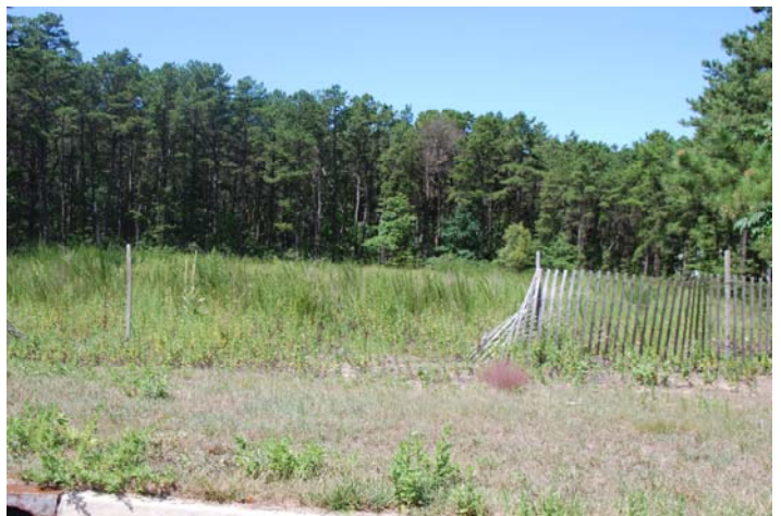
Location 11: View looking northeast towards industrial subdivision