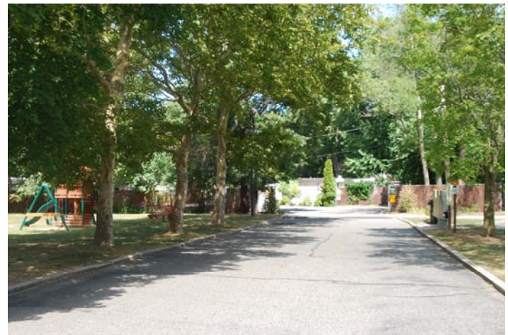
Location 13: View looking north towards manufactured housing community, on north side of SR 24