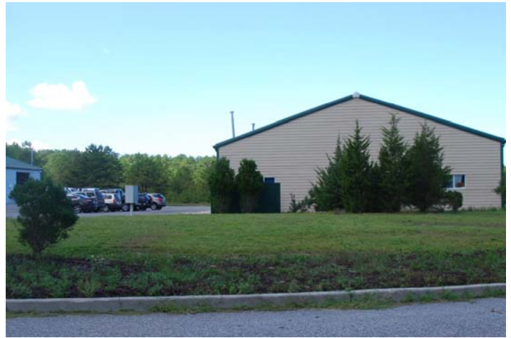
Location 12: View looking west towards industrial subdivision