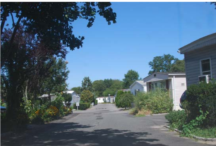
Location 13: View looking north towards manufactured housing community, on north side of SR 24