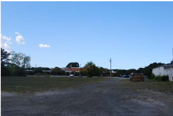
Location 16: View of Phillips Elementary School