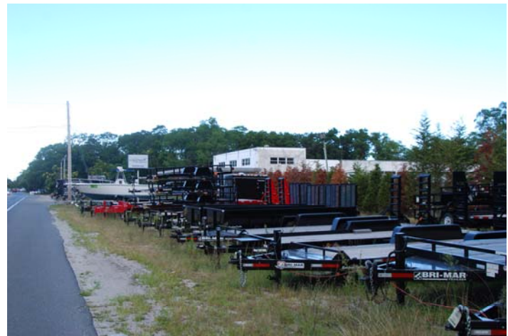
Location 17: View looking northwest towards boats and trailers on Riverleigh Avenue