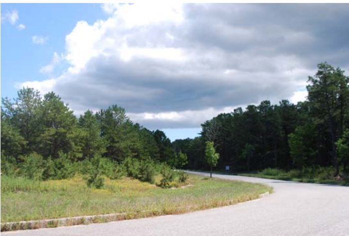
Location 11: View looking southwest down Enterprise Drive towards industrial subdivision