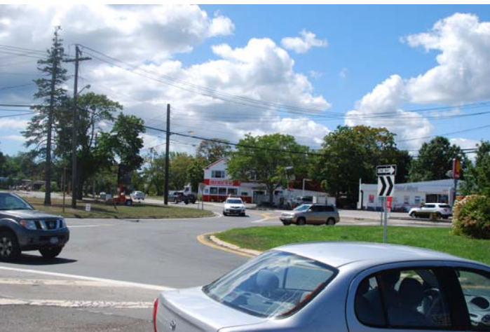
Location 4: View looking west towards Shell Station in background