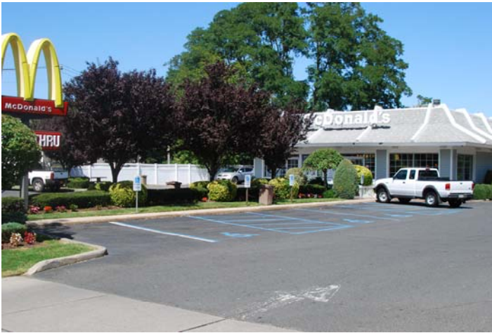
Location 1: View looking north towards McDonalds Restaurant