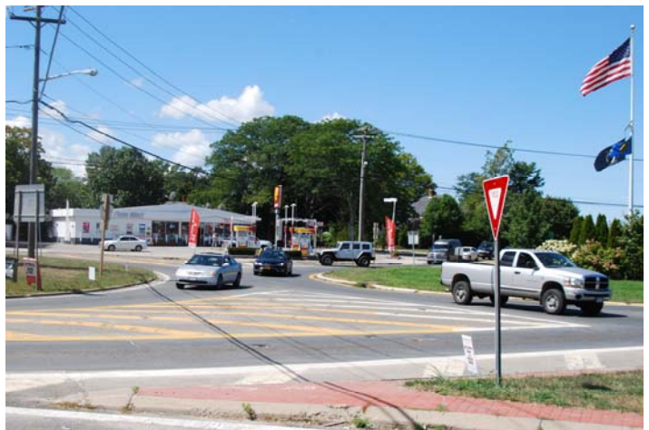
Location 4: View looking west towards Shell Station (View 2)