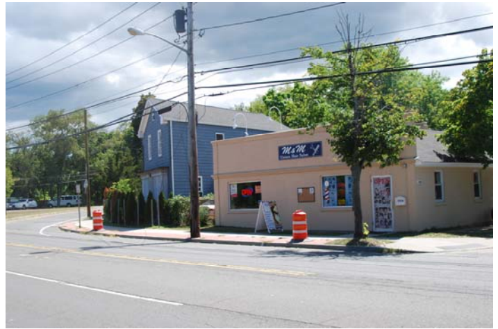
Location 9: View looking southeast across SR 24 towards Old Quogue Road