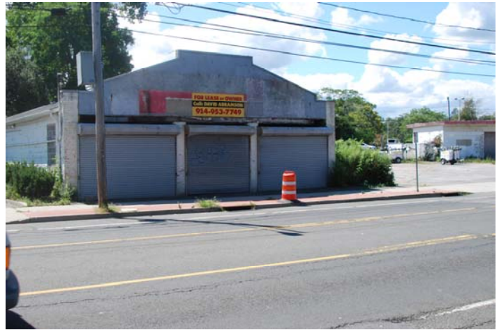
Location 1: View looking south towards abandoned commercial building