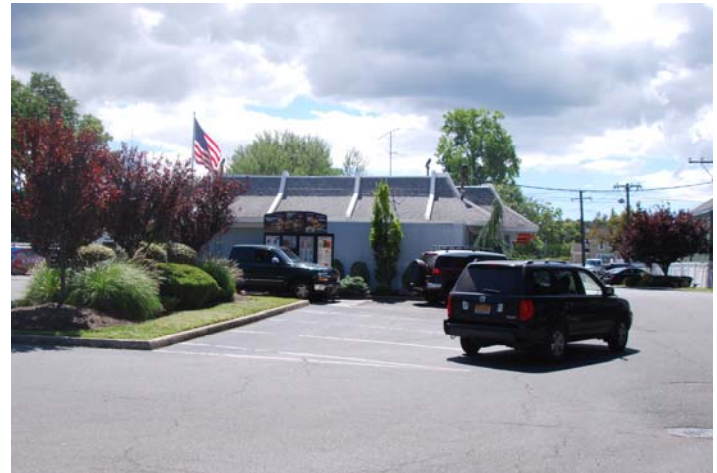
Location 6: View looking south towards McDonald's restaurant