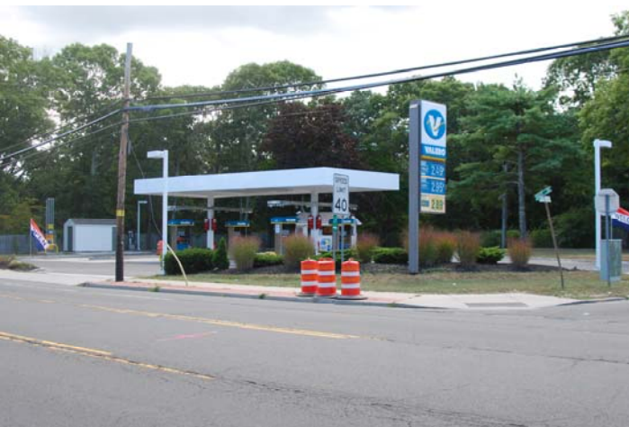
Location 15: View looking southwest towards Valero gas station