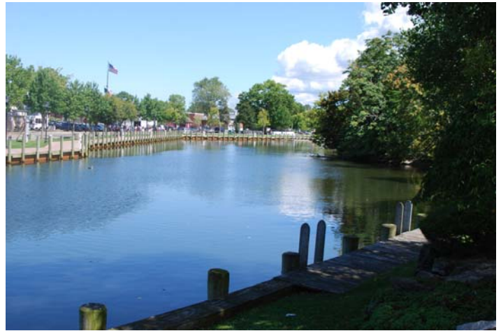
Location 6: View looking east towards Peconic River