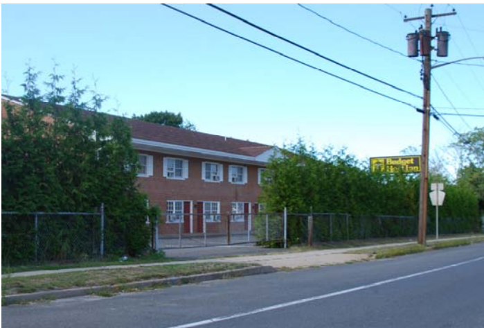
Location 21: View looking west towards Budget Hotel from Riverleigh Avenue