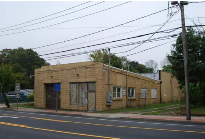
Location 5: View looking southeast towards vacant building