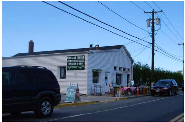
Location 20: View looking west towards Billiard World off of Riverleigh Avenue