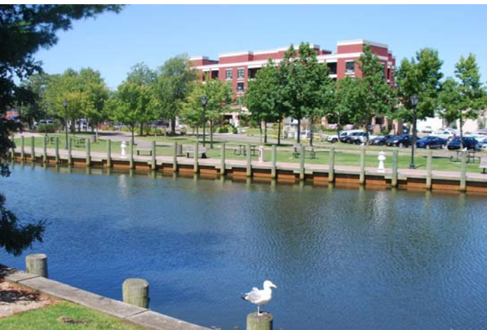
Location 6: View looking northwest across Peconic River, Riverhead Downtown in background