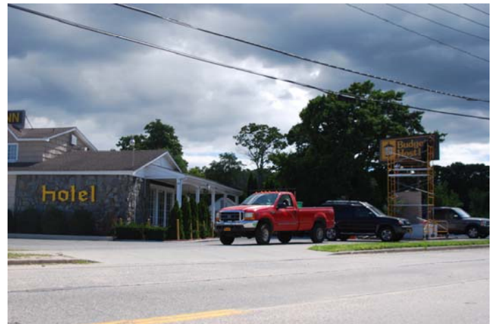
Location 22: View looking east towards Budget Hotel from Lake Avenue