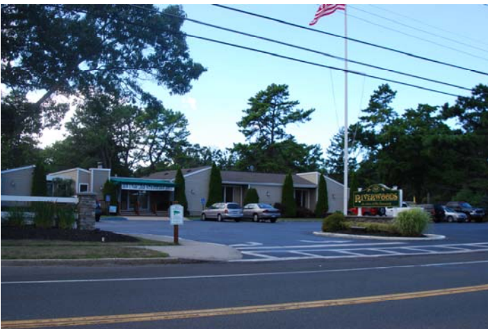
Location 17: View looking southwest towards Riverwoods