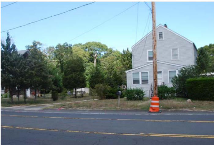
Location 15: View north from SR 24, view of residence