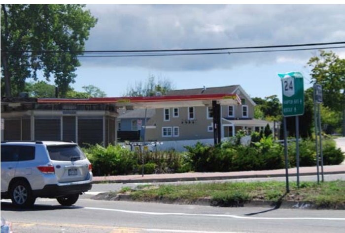
Location 3: View looking southeast towards abandoned gas station