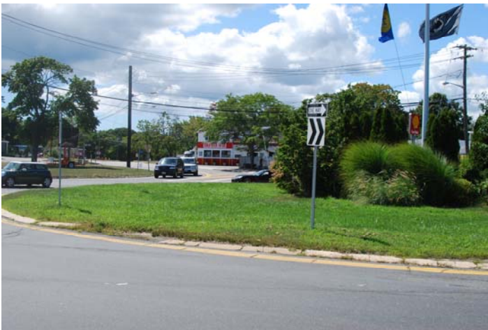
Location 3: View looking southwest towards median of traffic circle (View 2)