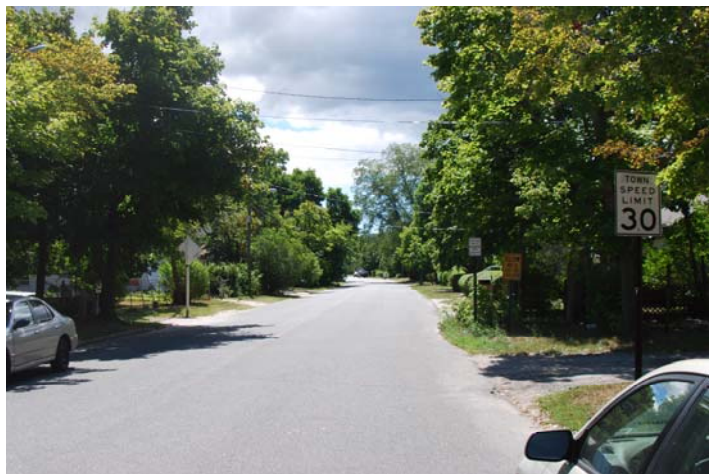
Location 7: View looking south down Vail Avenue