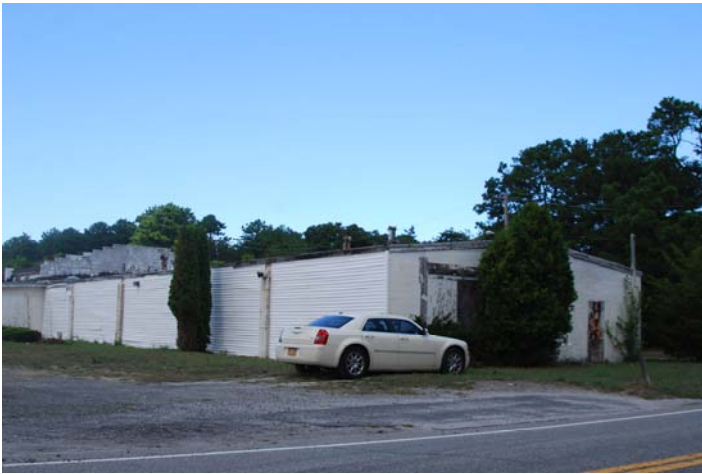
Location 16: View of vacant building east of Phillips Elementary School