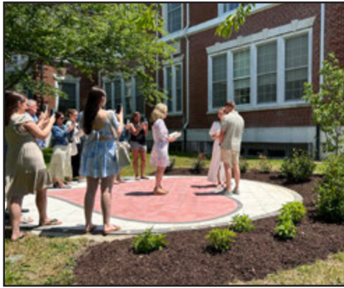
First ceremonies with landscape